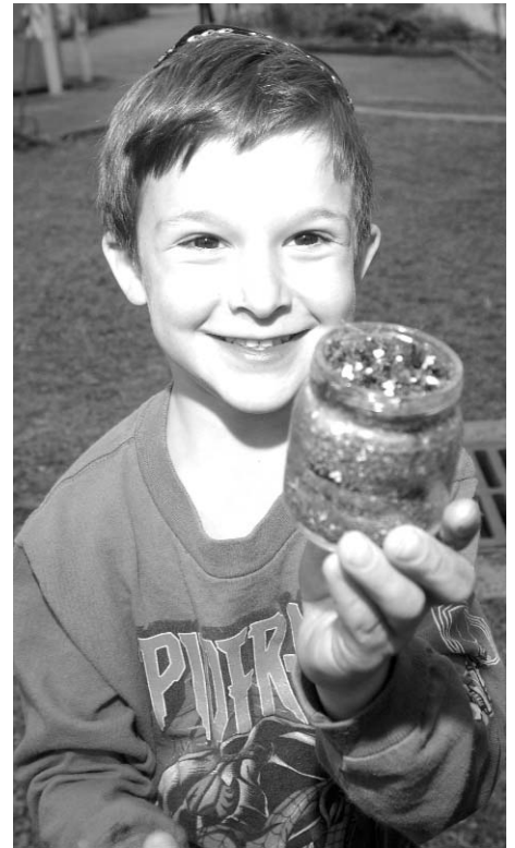
Root Views, a free program offered on Gardening Day, provided kids the opportunity to plant a seedling, watch it grow, and learn about the structure of plants.

The Children's Garden is enjoying lead support from HSBC in the Community (USA) Inc. in 2004.