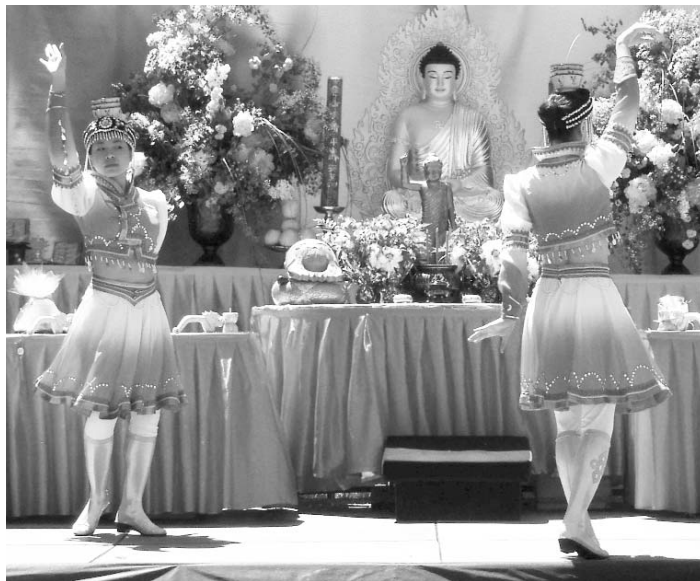
In May, Flushing's Buddha's Light International Association held an outdoor celebration at QBG, with performances, food, and activities for kids.

Learn how to harvest, dry, and store herbs. Discover which part of the plant is used and the different methods used to make special potions and personal blends.