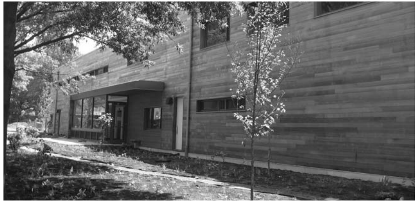
View of north facade, featuring FSC certified cedar siding