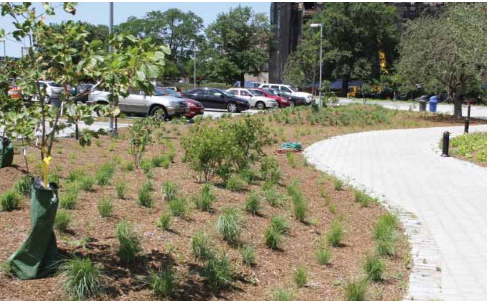
The Parking Garden combines water management and beautiful plantings with parking for over 100 cars.

43-50 Main Street, Flushing, NY 11355 718.886.3800 www.queensbotanical.org