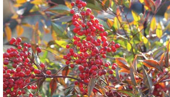
Nandina domestica (Heavenly Bamboo)