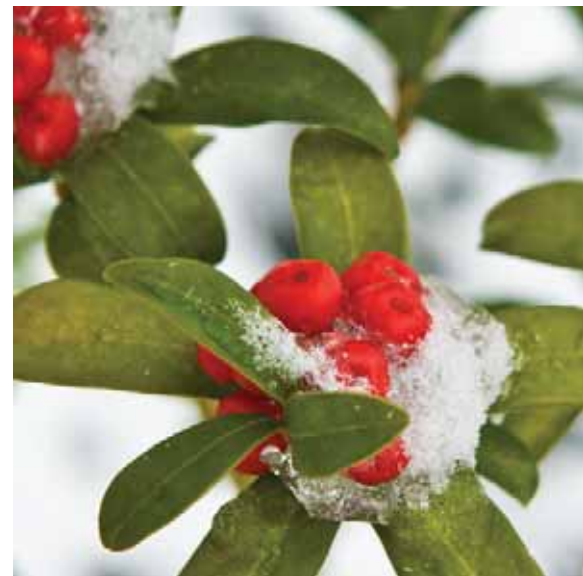
Skimmia berries bedazzled with snow.

Calendar of events, what's in bloom ..... page 3-4